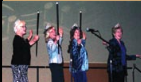
Several members of Region 21 performed on the Coronet Club Show, including 1984 Quartet Champions 4 for the Show (shown here at an afterglow doing their famous "cane" routine).

Members of Region 21 were active throughout the convention week – and not just competing. A few non-competition highlights: