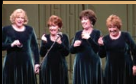
A cappella Gold performed their winning "Oreo Cookie Jingle" and thanked the voters for their support in the quartet's victory in the jingle contest.